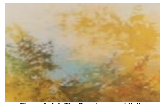
Figure 5. 1.4. The Prominence of Yellow In second focal point is a tree at the center of the midground just infront of the hut. The best part of this creation is its application and form. The counter line of this tree is slightly tilted and upper part have

The first focal point of this painting is potray of two lady figures near of the hut who are very beautifully created. The front lady wears a pink drape also commonly called as dupatta, with black skirt also known as ghagra. In one of her hand she holds a brown basket on her head and in the other hand is cover back of her dupatta. Second figure is a potray of young girl just follow the first lady figure. Girl is wearing a parmanent yellow kurta with long black hair. Both the figures are covered with yellow ochere shades but at the right hand side of the composition is a tree shown with black color stem and a new leaves of sap green.