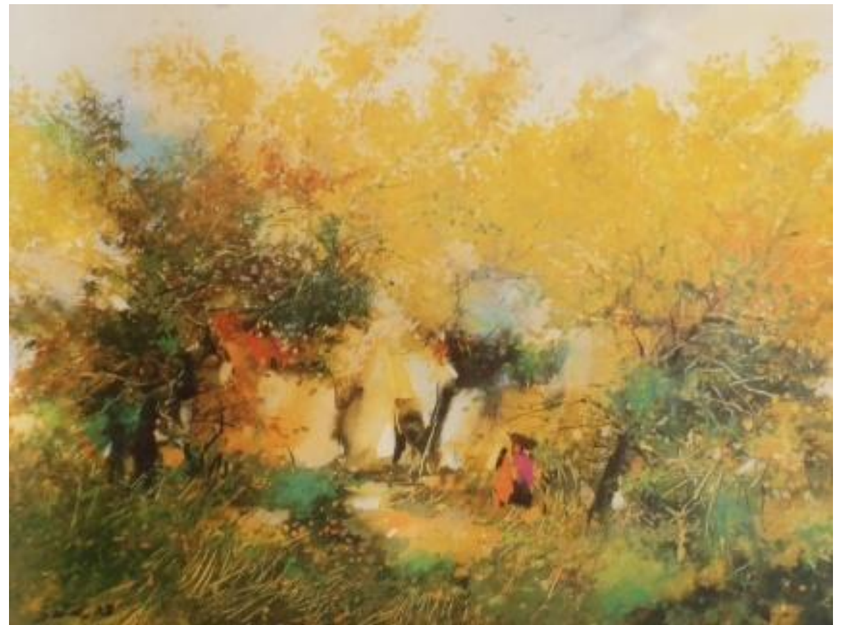
Figure 1 The Prominence of Yellow

VOL-3* ISSUE-12* (Part-1) March- 2019 Remarking An Analisation