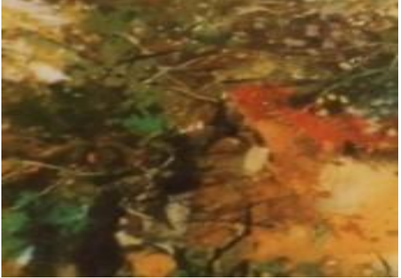
Figure 4.1.3. The Prominence of Yellow

The maximum part of the canvas have covered with the tints and shades of yellow. To show the lower part of land here Chandra has slightly differentiated with yellow instead of cadamium yellow. He uses darker shades of yellow like yellow ochere, pale yellow, and some patches of grey as well as sap green and raw umber creates the volumes and 3dimentional effect to the painting.