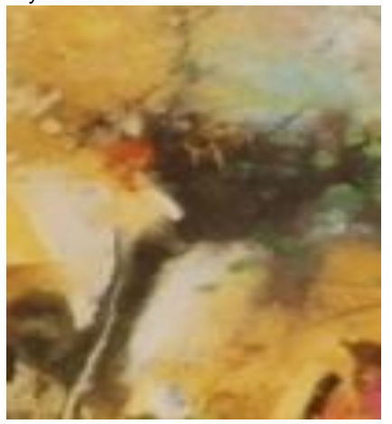
Figure 3. 1.2. The Prominence of Yellow

The treatment or application of using the medium is different. At some places he use water color technique and some part are blended with more then two colors. For highlighting he uses opaque as well as semi opaque treatment. At the right hand side he articulate two large trees which has almost covered the hut. The lower part of the tree is fill with dark shades and the uper part have some tints of green and yellow ochere (light orange) in shades. Behind of the huts a number of trees having vivid cadamium yellow.